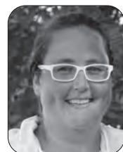
DISTRIBUTION Christy Brown