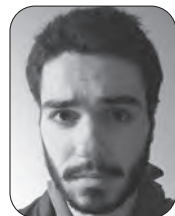
REPORTER/PHOTOGRAPHER Ty Dilello