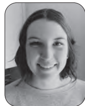
REPORTER/PHOTOGRAPHER Autumn Fehr