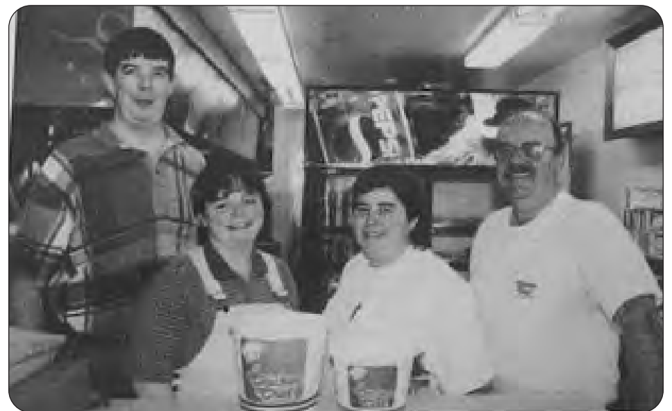
STANDARD PHOTO SUBMITTED

Chicken Chef always fought against the percep-